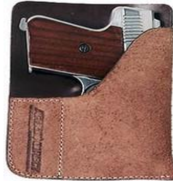
But I need my wallet...

On the left is a .40 caliber pistol mounted in a car next to the driver's right leg. This is why officers like to see your hands up on the steering wheel and not down at your sides. On the right is a wallet gun that holds a .25 caliber automatic pistol. This is why officers don't like you to put your hands in your pockets.