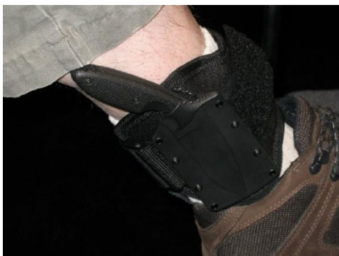
Mind if I tie my shoe?

On the left is a .40 caliber pistol mounted in a car next to the driver's right leg. This is why officers like to see your hands up on the steering wheel and not down at your sides. On the right is a wallet gun that holds a .25 caliber automatic pistol. This is why officers don't like you to put your hands in your pockets.