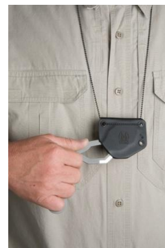
I'm having chest pain...

Here are a few common knives that can easily be purchased over the internet. The left photo shows a knife in an ankle holster. These knives are easily accessed