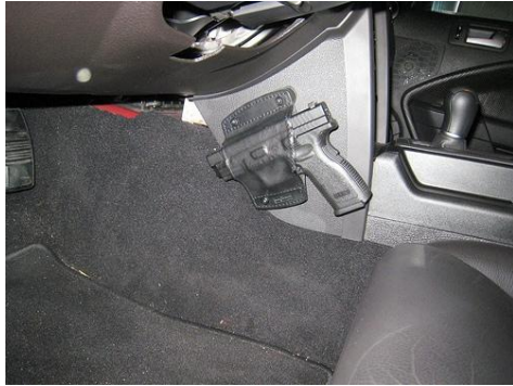
I dropped something on the floor...

four rounds into this fake phone and discharge the rounds by pressing numbers 5, 6, 7, and 8 on the keypad. Can you tell these are weapons?